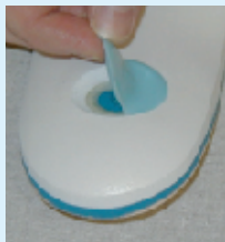
Remove Set Silicone

Follow the steps below to adhere Quick-Sil to materials using silicone adhesive: