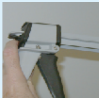
Set Up Mixing Gun