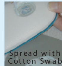
Spread with Cotton Swab

To adhere Quick-Sil to material, spread a small amount of QuickPrime over area. (*Not necessary if using silicone adhesive)