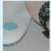
Wait Five Minutes

Follow the steps below to adhere Quick-Sil to materials using silicone adhesive: