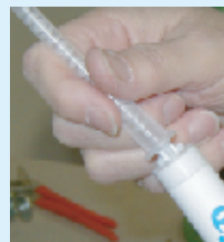
Add Static Mixer